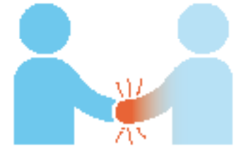
Figure 1. Young people are entering the workforce with incipient or pre-existing injuries

Further, it's plausible that this group's threshold for re-injury may be much lower than older workers. Thus, organizations should offer furnishings (sit-stand worksurfaces, adjustable task lighting, monitor arms, etc.) and training programs that reduce the risk of further problems with currently-injured employees.